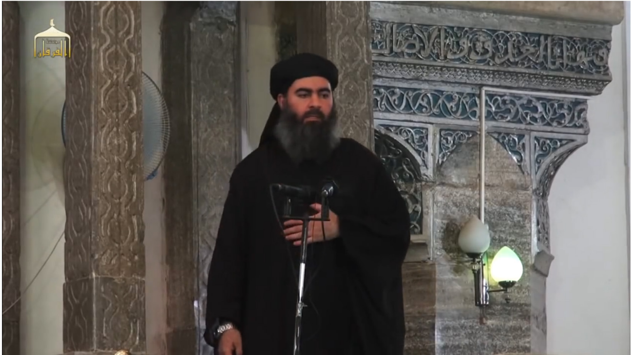
Islamic State leader Abu Bakr al-Baghdadi is pictured in the group's July 2014 video release.

ground with the sheikh above them “on a chair [with] a table in front of him and on the table books and a half-filled water bottle.” The sheikh’s elevated position would signify his importance, the books on his desk his intellect, and the half-empty bottle the fact that he has been lecturing for some time already. As well as this, the document suggests a few recommended “angles of filming”—among other things, eye-level shots of “the brothers sitting in circles” and footage captured from behind one of them to “show the sheikh” sitting above—and notes that the various contents of the scene (in this case, books, clothes, bottles, chairs, and desks) should all be “related to the intended message” of the final product.