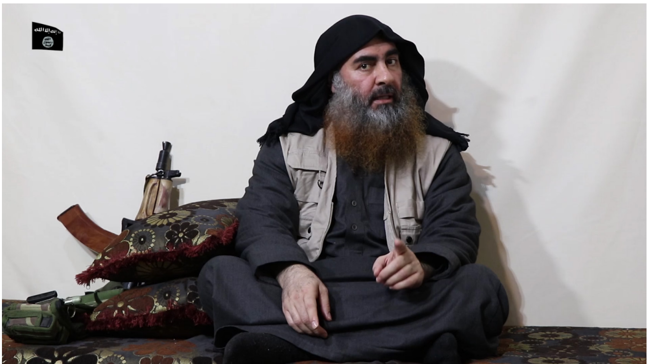
Islamic State leader Abu Bakr al-Baghdadi is pictured in the group’s April 2019 video release.

Structurally speaking, this video was worlds apart from his 2014 appearance in Mosul. His speech was framed as a briefing to his inner circle, not a sermon to the masses. He began by reeling off a list of prominent members of the Islamic State who had been ‘martyred’ during the battle for Baghuz earlier in the year—among them many foreign fighters. Al-Baghdadi then took the time to name and praise commanders from across the media, sharia, and military departments, demonstrating that he was an engaged leader well aware of what the techno-structure and middle management of his organization were doing. He later commended those that had been involved in “the raid to avenge wilayat al-sham [Levant province],” in which the Islamic State purportedly carried out 92 attacks in eight countries in response to its defeat in eastern Syria.