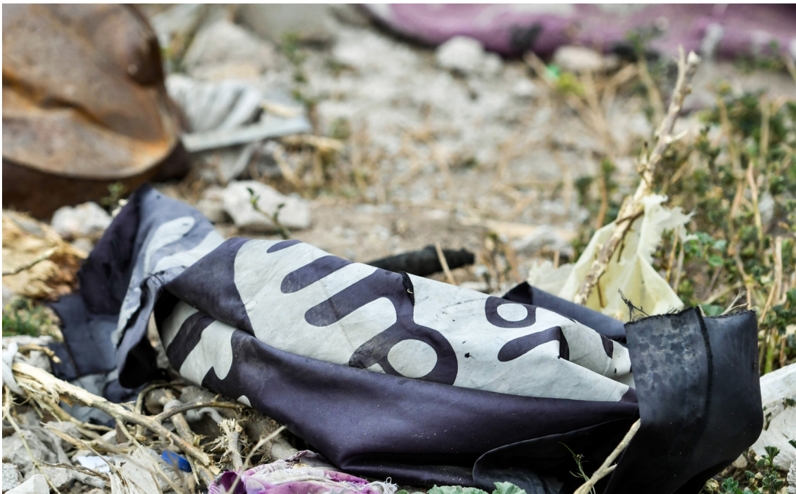
A discarded Islamic State flag is pictured on the ground in the village of Baghouz in Syria's eastern Deir ez-Zor province near the Iraqi border on March 24, 2019, a day after the group's 'caliphate' was declared defeated by the U.S.-backed Kurdish-led Syrian Democratic Forces (SDF).