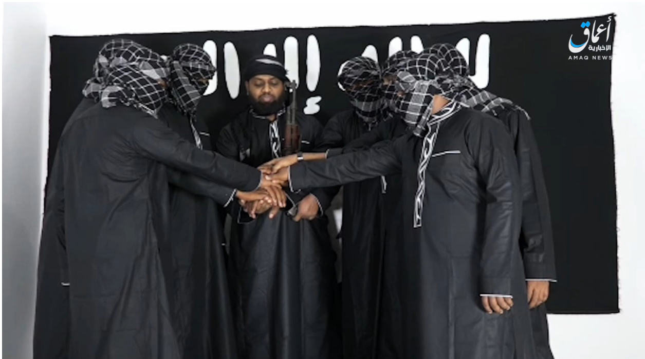
Figure 1: Screen capture from April 23, 2019, video released by the Islamic State showing Zahran Hashim (center) and other individuals pledging allegiance to Abu Bakr al-Baghdadi