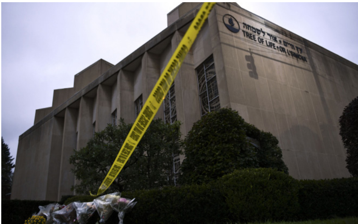
Police tape and memorial flowers are seen on October 28, 2018, outside the Tree of Life Synagogue after a shooting there left 11 people dead in the Squirrel Hill neighborhood of Pittsburgh on October 27, 2018.

ethno-nationalist policies, extreme right groups focused on ethnic purity have risen to prominence in a variety of different European countries. Those that have adopted identitarian doctrines are fixated on Frenchman Renaud Camus's 2012 Great Replacement theory, which, though focused on the white Christian population of France, describes "the process by which the indigenous European population is replaced by non-European migrants." 80 However, unlike the American variant of this 'white genocide' ideology, in the Great Replacement theory, Muslims are the threat and Jews, like Christians, are victims. 81 This doctrinal difference of the European variant of "white genocide" theory as it relates to Jews may have moderated its violent influence against Jews in Europe.