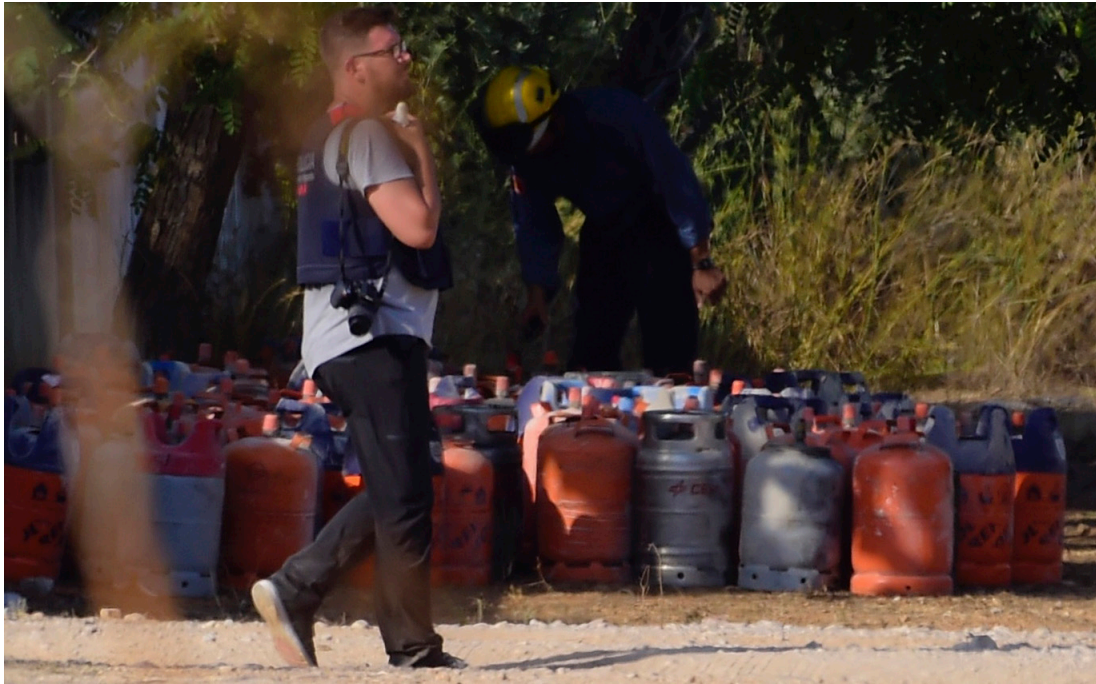
A policeman walks past gas bottles in Alcanar, Spain, on August 18, 2017, during a search linked to the Barcelona and Cambrils attacks.