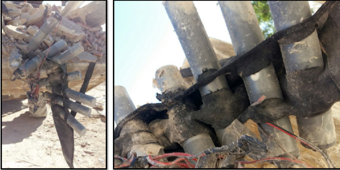
The viable suicide vest found in the rubble at the cell's Alcanar bomb factory. Photographs from different angles obtained by the authors from investigators.