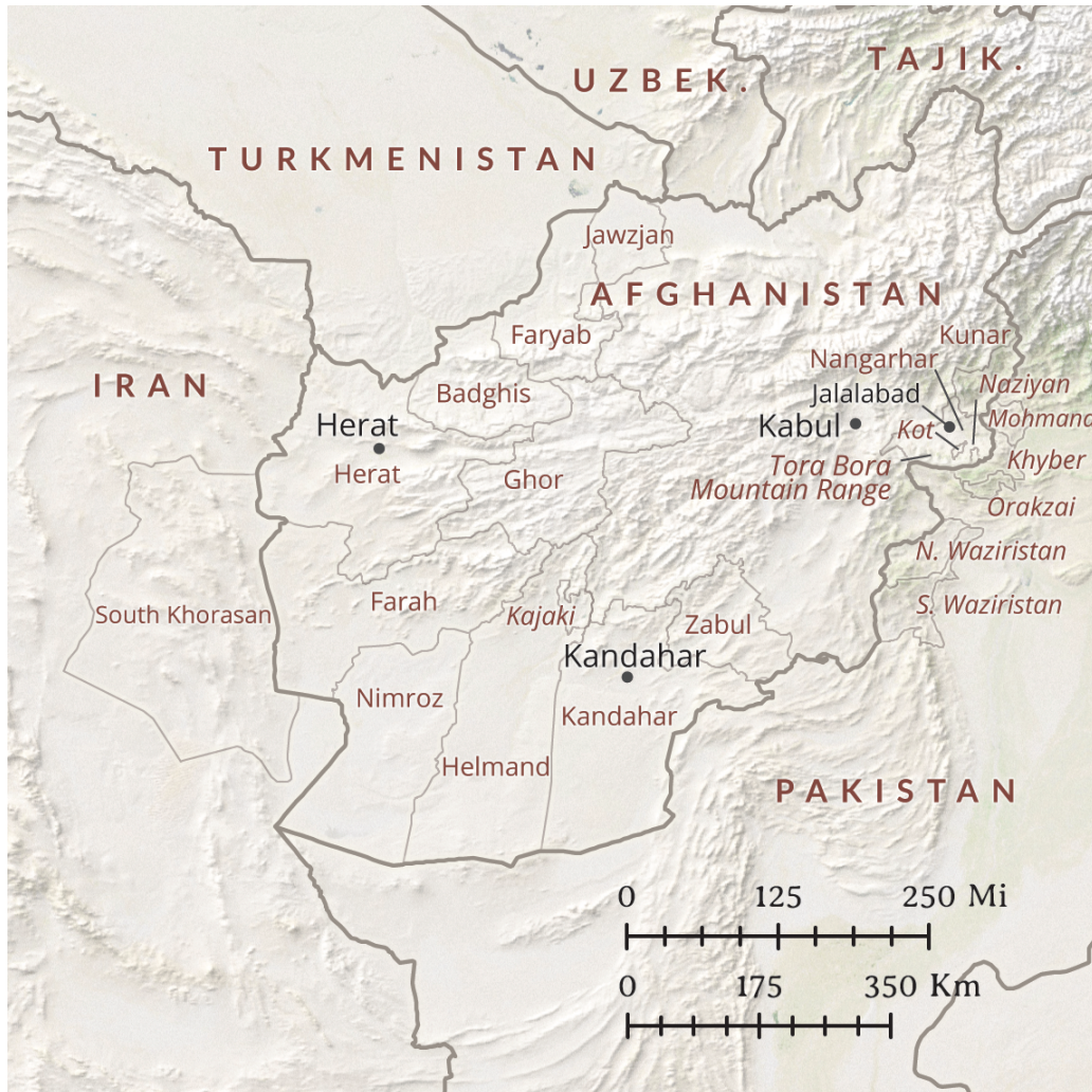
Afghanistan (Rowan Technology)

garhar provinces where the Taliban reap windfall profits from the area's poppy cultivation. 6