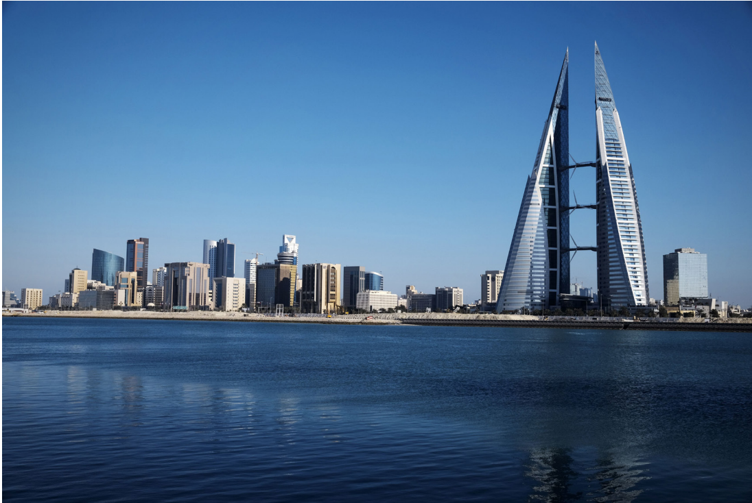
Manama, Bahrain, in 2016