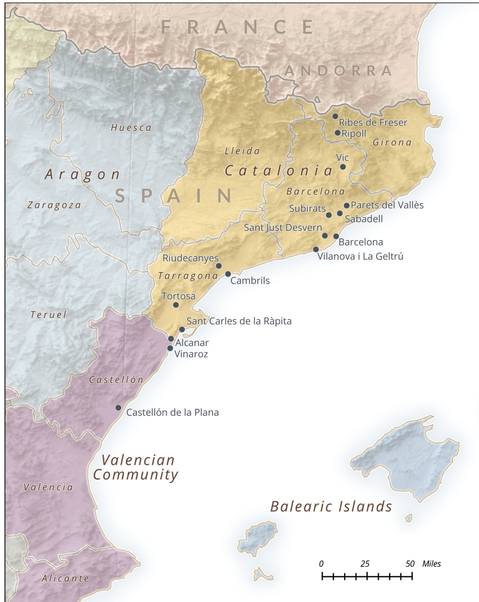
Northeast Spain (Rowan Technology)